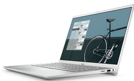
New Inspiron 14 5000 Laptop

If you are anxious to get started with OLLI's online courses, but don't have a device at all, or don't have something new enough to work with Zoom, check out the following OLLI recommended devices listed at www.Dell.com/SVSUOLli